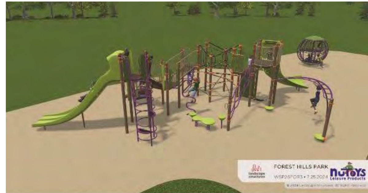
Forest Hills Playground Renovation