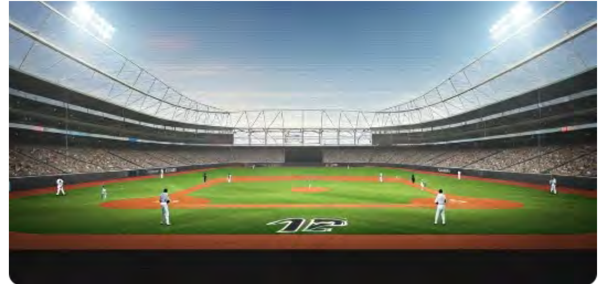
Spring Rock Matt Orth Field Lighting