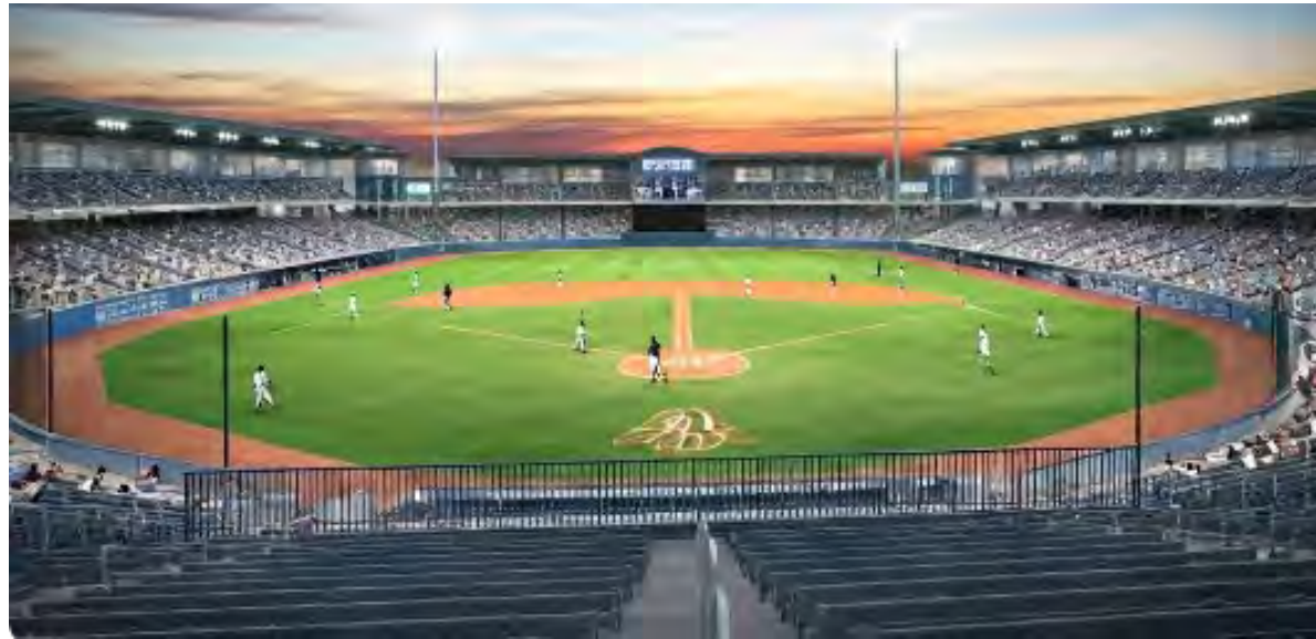
Spring Rock New Softball Field