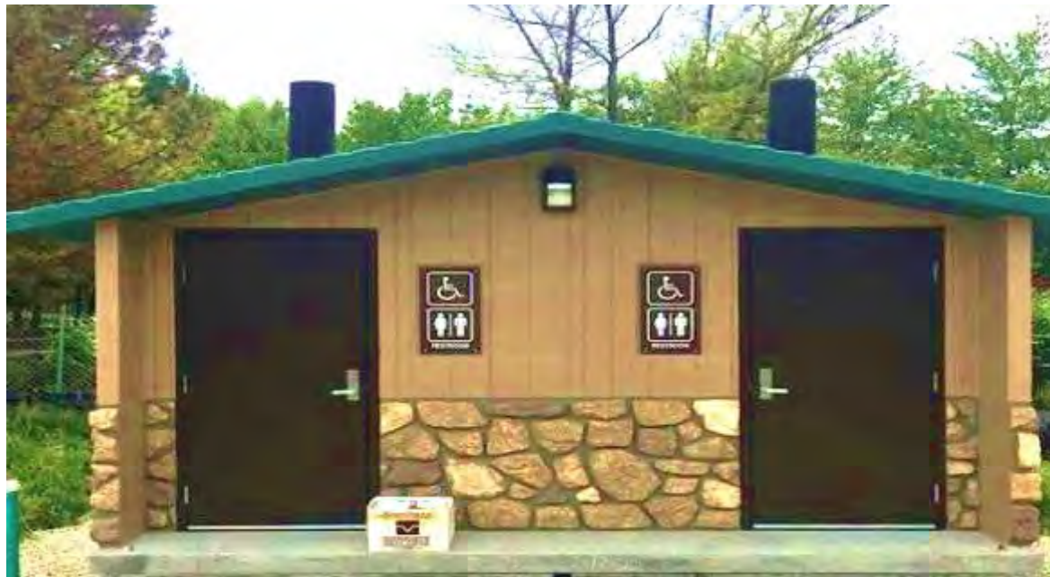
Springdale Sustainable Prefab Bathroom