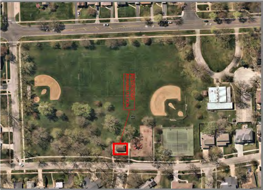
Springdale Park Bathroom - $250,000