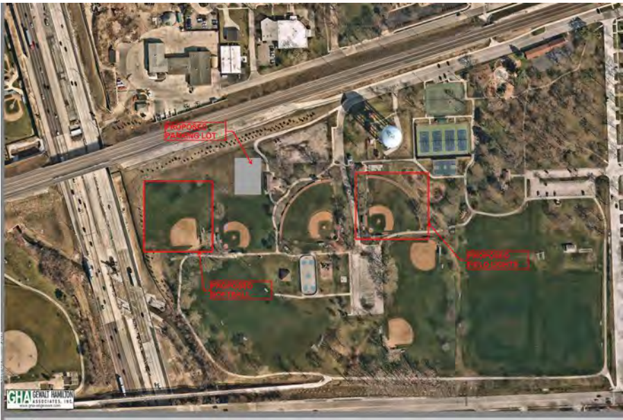
Spring Rock Park Softball Field - $350,000 Spring Rock Park Matt Orth Lights - $150,000