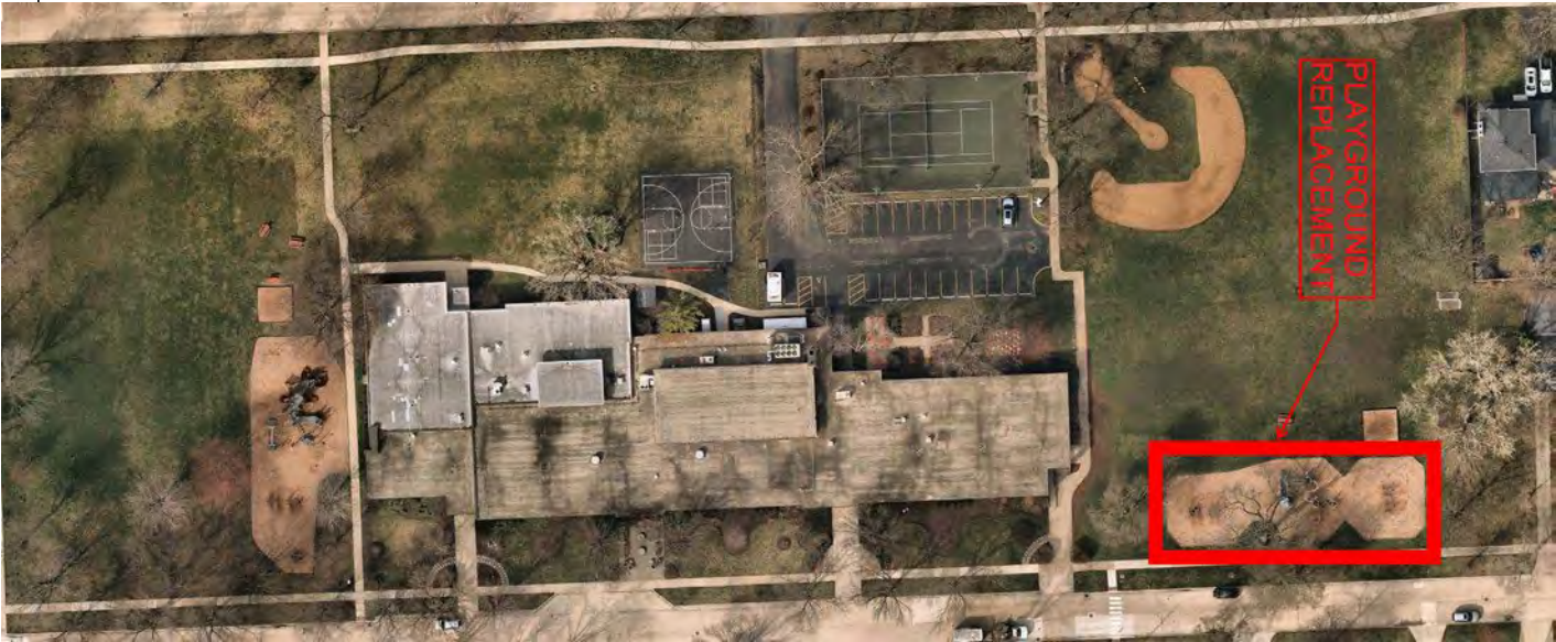
Forest Hills Park Playground - $350,000